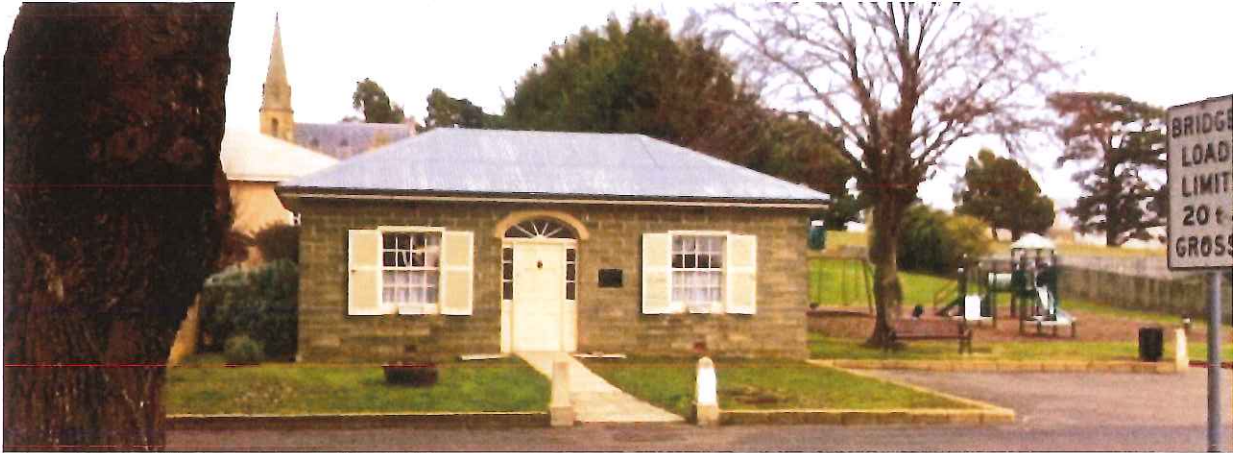
Ross Clinic ~ opened in 1955

Kim Peart 39 Bridge Street Ross 7209 Tasmania