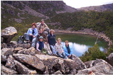
Tranquil Tarn Ben Lomond

At Avoca the Old School building in Boucher Park was restored by locals and opened on Australia Day, 26 th January 2012 as the Avoca Museum and Information Centre showcasing the history of this area where many families still carry the names of early European settlers.