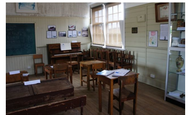
Avoca Museum and Information Centre

Or, the Old Coach Road from Avoca will take you via Royal George to the coast, with side trips to Hardings or Meetus Falls ; adventures to be enjoyed. The Old Coach Road is a reasonably good gravel road from a few kms past Royal George to the coast road.