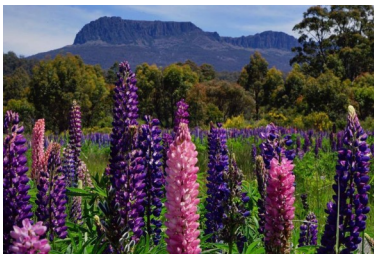
Stunning view of Ben Lomond from Rossarden

The views of Ben Lomond are stunning. 5km further on is Craggy Peaks with its 16 luxurious cabins.