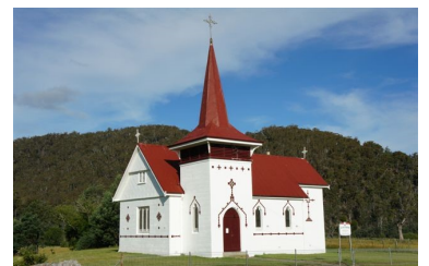
'The Cathedral of the Valley' Mangana