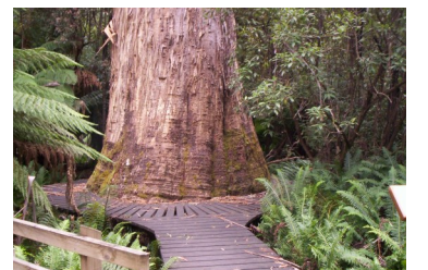
Evercreech White Gum Board Walk