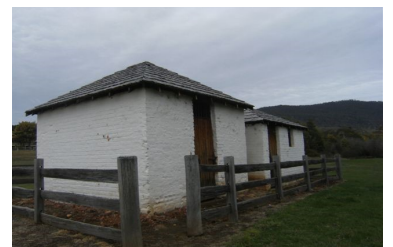
Fingal Convict lock-up