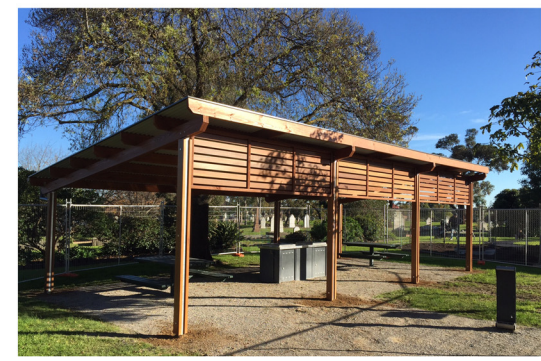
Large group picnic shelter.