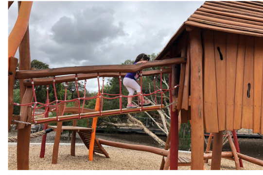
Nature based playground.