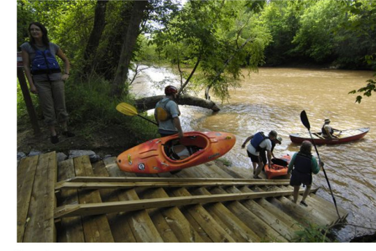
Flood proof canoe launch.